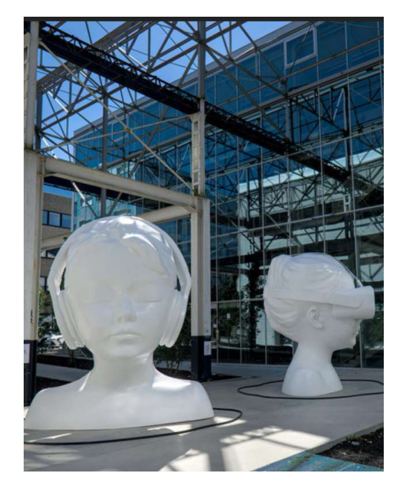
Halle 6 Nantes, photo credit Université de Nantes