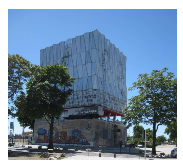
La Fabrique Nantes